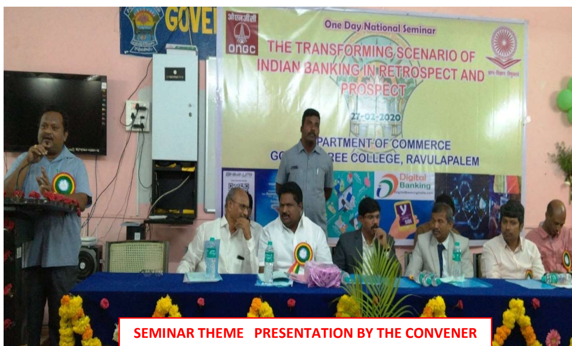
SEMINAR THEME PRESENTATION BY THE CONVENER